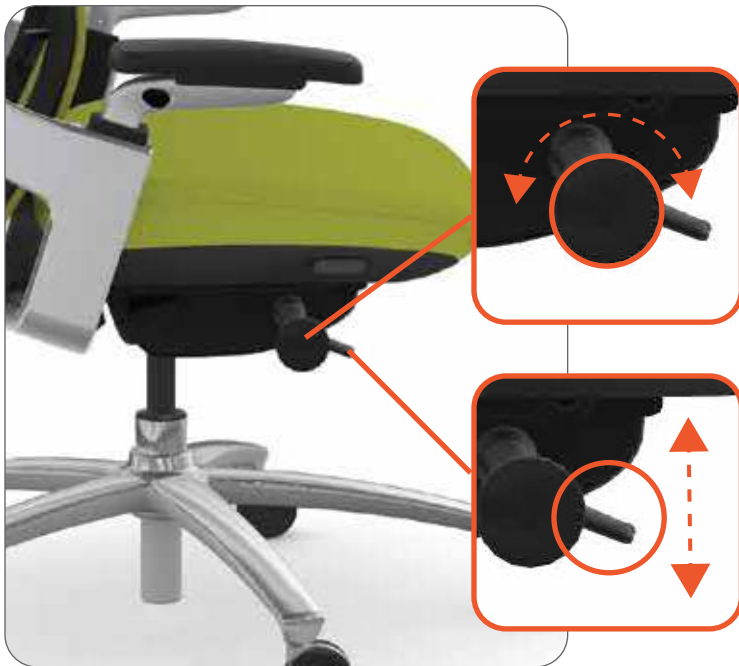
Seated Right Side (SRS)